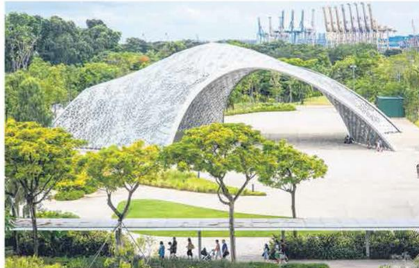
The Future of Us Pavilion by the Singapore University of Technology and Design, one of nine Design of the Year award winners, became a permanent landmark at Gardens by the Bay last year and plays host to festivals and other events.